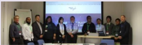
TWI Workshop – Nov 2018