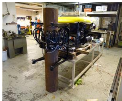
LRUT mounting on an ROV